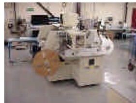
T&R with Vision